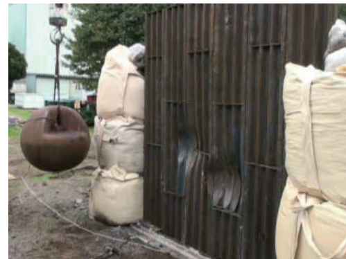
Photo 3 Heteromorphic situation of outside protection materials

confirm that the material satisfies these requirements. Impact load was applied to the upstream-side outside protection materials, and the fact that the panels and their joints form a structure with a function of preventing exposure of the filling material was confirmed.