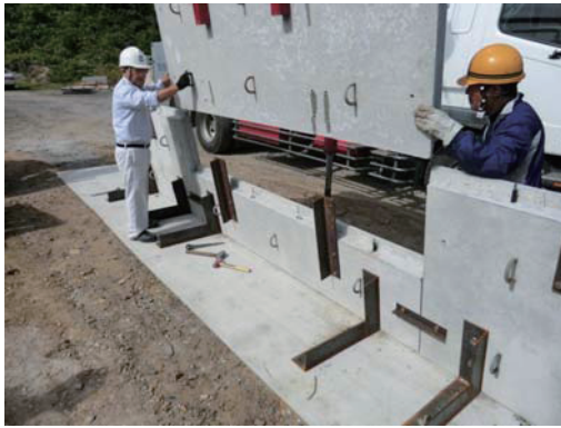
Photo 1 Assembling examination

possible to reduce the cross section by adopting a straight slope in the wing section (part above the spillway section). Because this makes it possible to reduce the amount of construction of filling material in the dam as a whole, “JS-Wall Dam” offers superior economy.