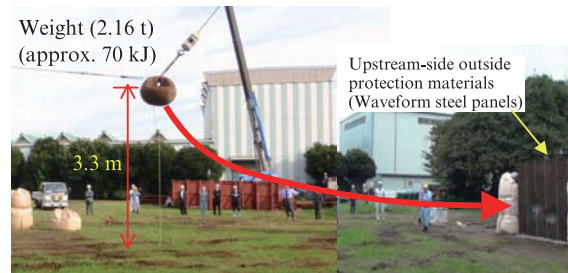
Photo 2 Experiment situation

Debris-flow load (stone impact load) acts on the upstream-side outside protection materials. Therefore, high impact resistance and high covering capability are required. An actual-scale test was carried out in order to