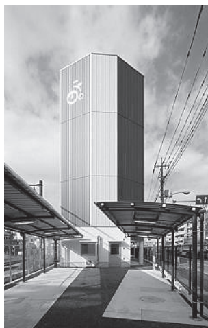
Photo 1 Above ground bicycle parking system

unlocked condition, and the front wheel is grasped by the axle holder of the parking machine. Both above-ground and underground systems are available.