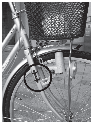
Photo 3 IC tag

The combination and layout of the facilities can be arranged freely, as required by the siting, site shape, legal regulations, and other conditions. As a result, the maximum storage efficiency, considering economy, can be realized even in limited spaces. An example of a layout with an efficient flow plan is shown in Fig. 2 (ground floor plan).