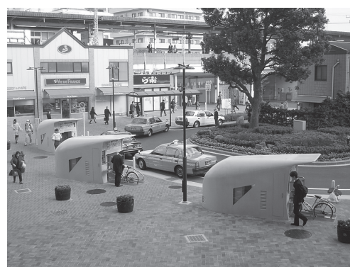
Photo 2 Under ground bicycle parking system

Cycle Tree is an elevator-slide-type mechanical storage system which raises/lowers bicycles to their storage level and stores bicycles on storage racks in the storage facility. Bicycles which are to be parked are set in an