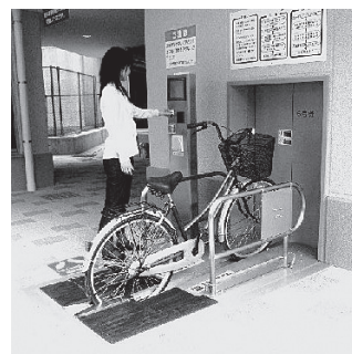
Photo 4 Entry operation

Cycle Tree features a “man-machine separation”